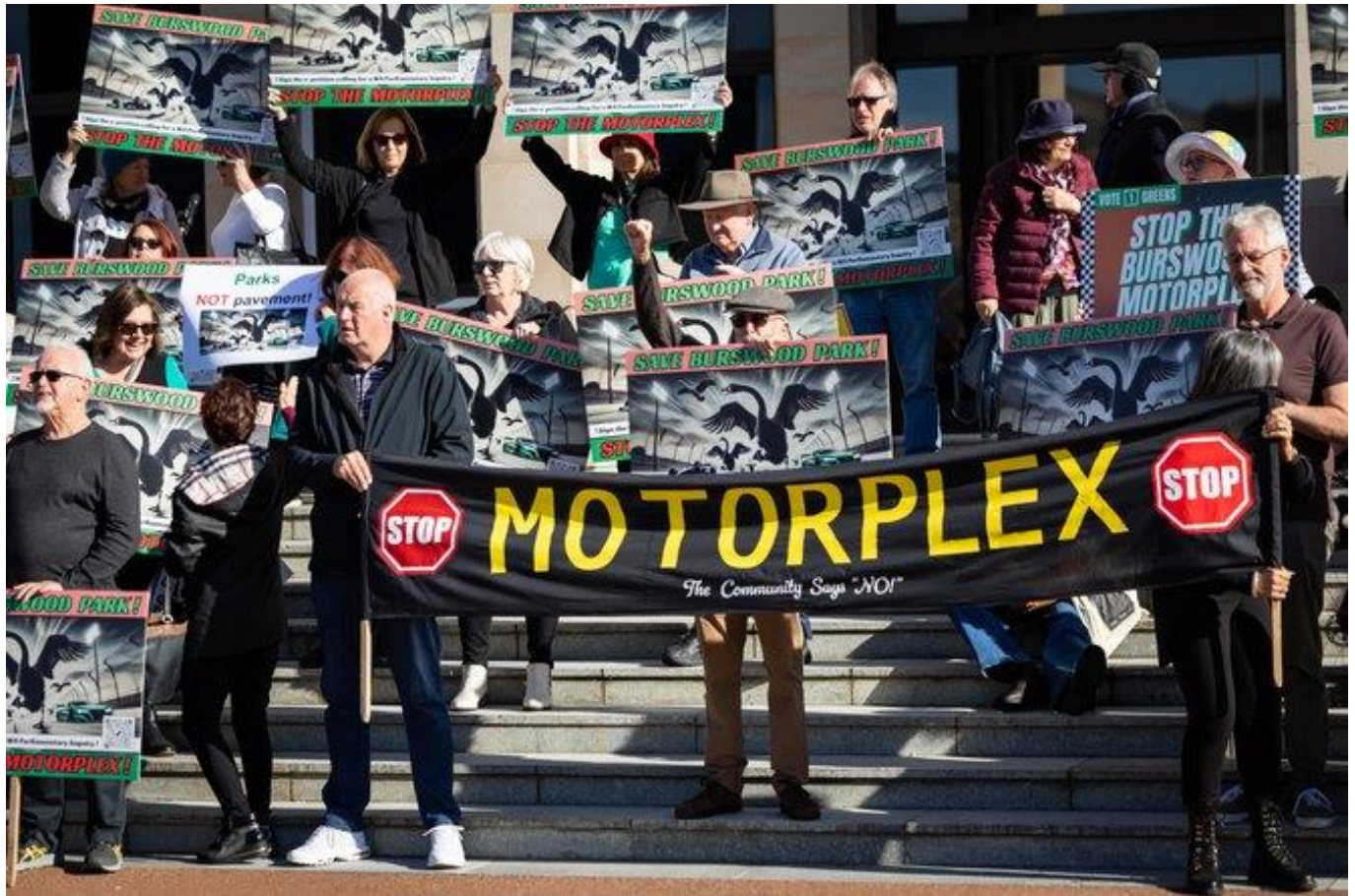
A rally against the Burswood race track at Parliament House.

“The signing of the DA form by the town is not to be construed as approval or support for the development, and there will be separate opportunity for the town to provide comments on the merits of the development once the development application is submitted and assessed through the community consultation process.” the officer’s report states.