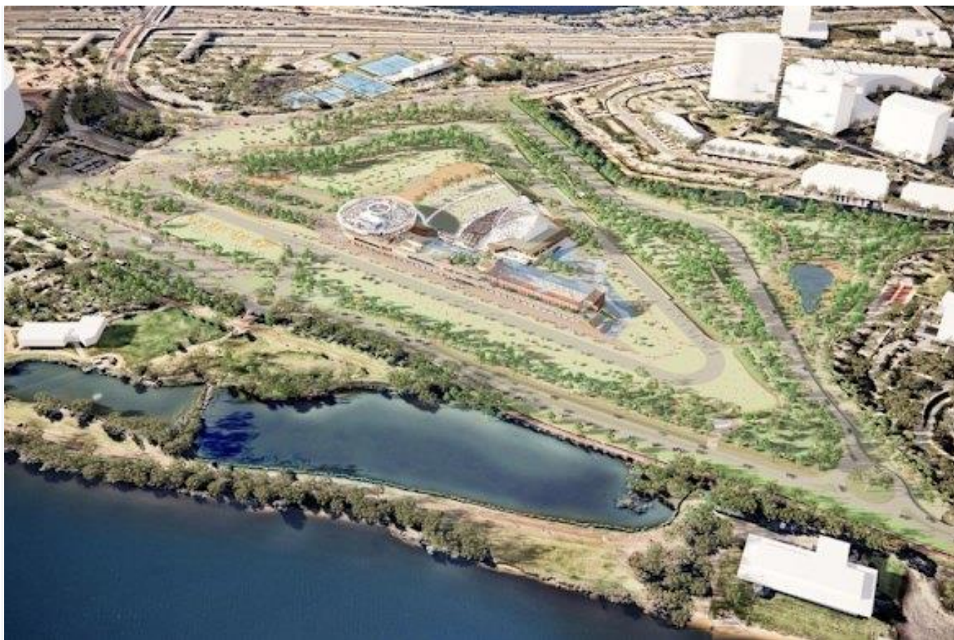
An aerial view of the precinct.

The project has previously encountered stiff opposition from the local government, member for Perth Patrick Gorman, environmental advocates and locals who will be impacted by the project.