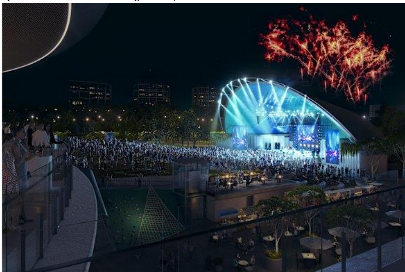
The amphitheatre as imagined at night. WA GOVERNMENT

“The first thing to go will be the trees - trees and race cars don’t go [together] and spectators cannot see through them,” one said.